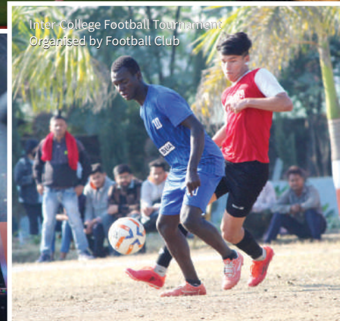
Inter-College Football Tournament Organised by Football Club