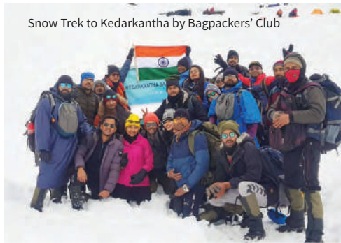
Snow Trek to Kedarkantha by Backpackers' Club