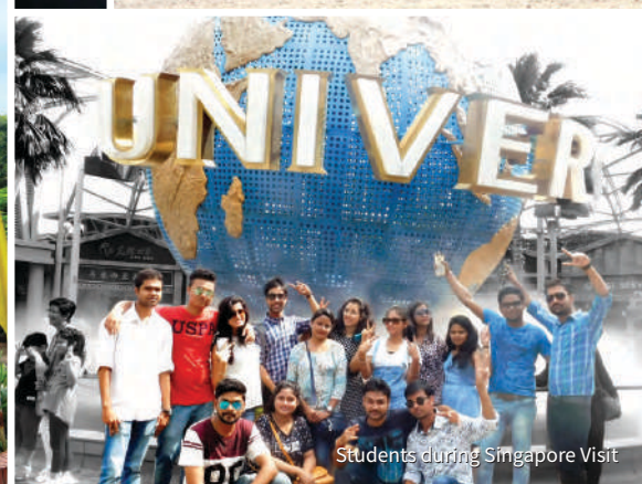
Students during Singapore Visit

Computer Science & Engineering | Management | Commerce | Law Liberal Studies | Film & Media | Agri | Forestry | Pharmacy | Para Medical | Hospitality